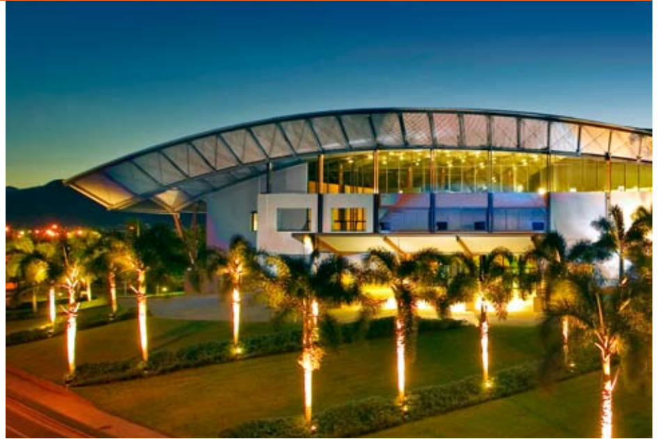
Cairns Convention Centre